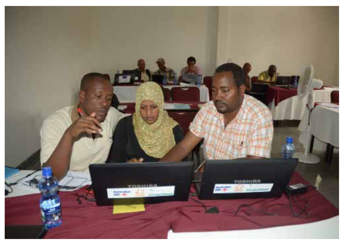
Staff from CARE Ethiopia and SOS Sahel Ethiopia.

munity groups – including marginalized and vulnerable women – aimed at improving accountability in delivering goods and services.<sup>2</sup>