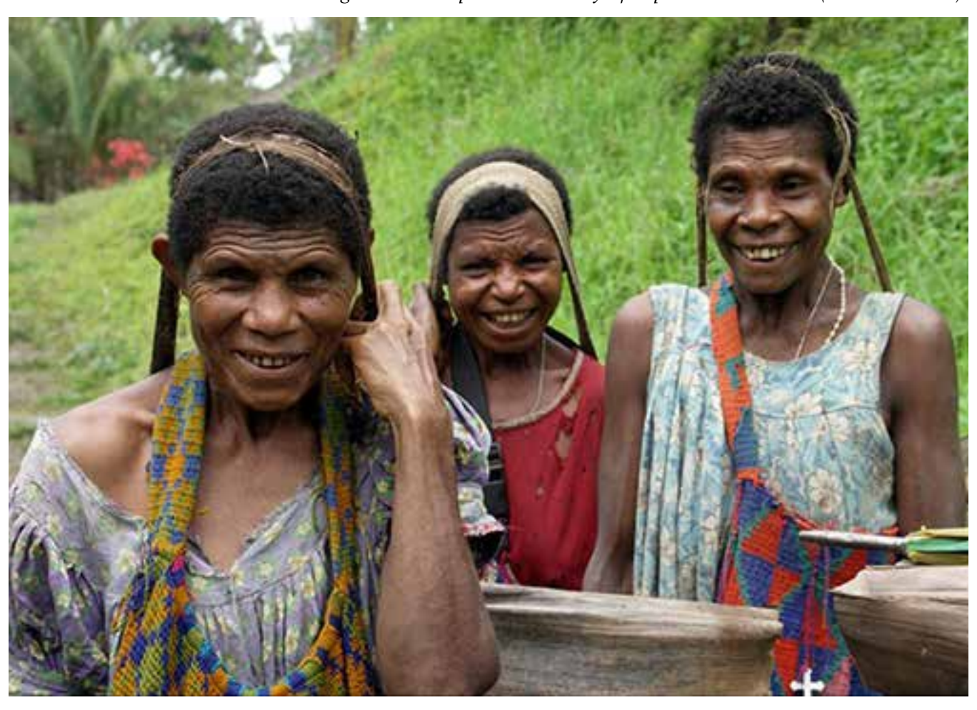
Villagers in the Sepik River Valley of Papua New Guinea.