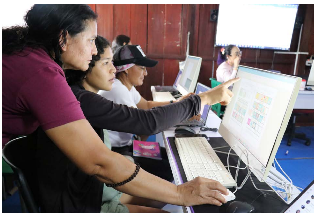
Grupo gestor de la Red Comunitaria Tejiendo Paz durante el taller de habilidades digitales básicas de la vereda Colinas Bajo, San José del Guaviare-Guaviare.

La metodología de apropiación TIC se puso en marcha en las redes comunitarias acompañadas por Colnodo desde el año 2025, con el objetivo de construir con las comunidades una ruta de aprendizaje para el uso significativo de las tec-