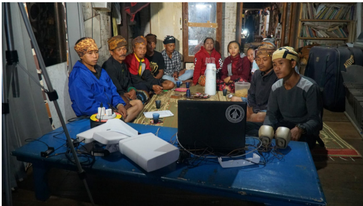
The first on-line workshop in Kasepuhan Ciptagelar during the COVID-19 pandemic outbreak in 2020.

Radio Swara Ciptagelar and Ciga TV in 2000's, until Community Networks deployment, which was started in around 2014 until present.