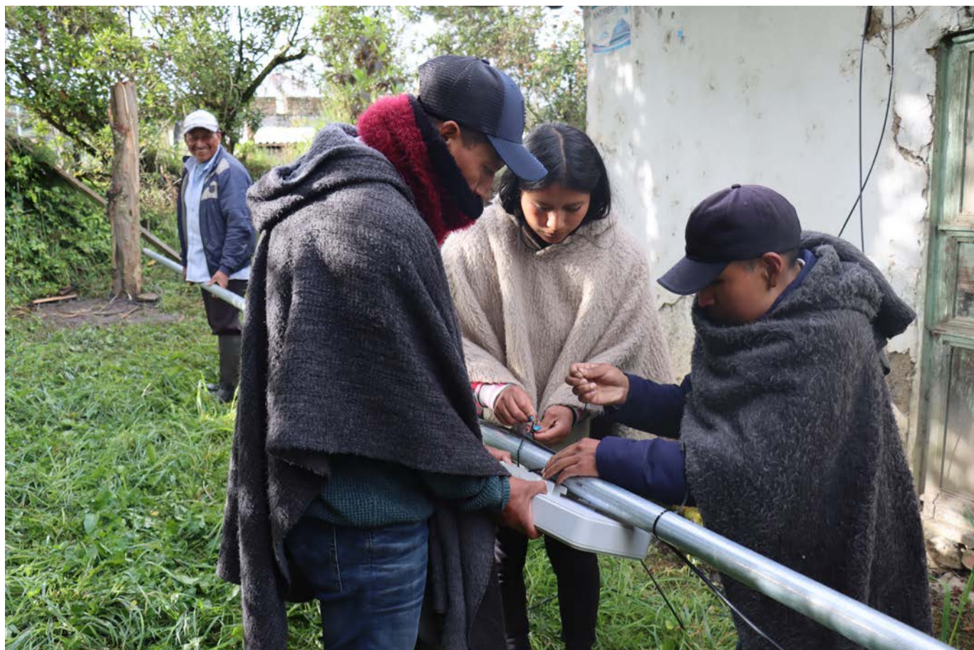
Jornada de instalaciones en la Red Comunitaria Frailejones: Conexión de Vida en la vereda Tasmag, Cumbal-Nariño.